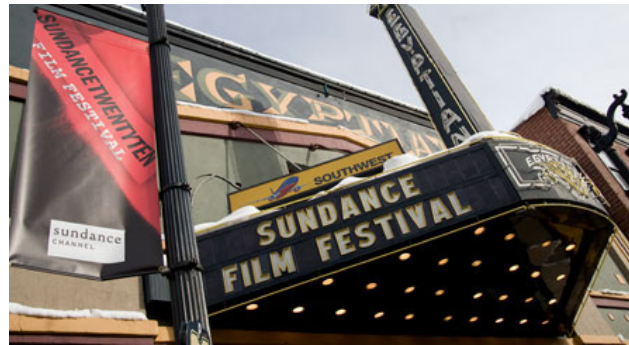
The largest independent film festival in the United States, Sundance needed an industrial-strength wireless infrastructure that could cope with huge numbers of concurrent Wi-Fi clients.

Last year, Sundance saw the local 3G cellular network come to a standstill as tens of thousands of patrons tried to connect to the Internet. With more and more moviegoers coming to Sundance armed with powerful smart phones, iPads and other wireless-enabled devices, Sundance knew that in 2011 it needed to make some big changes.