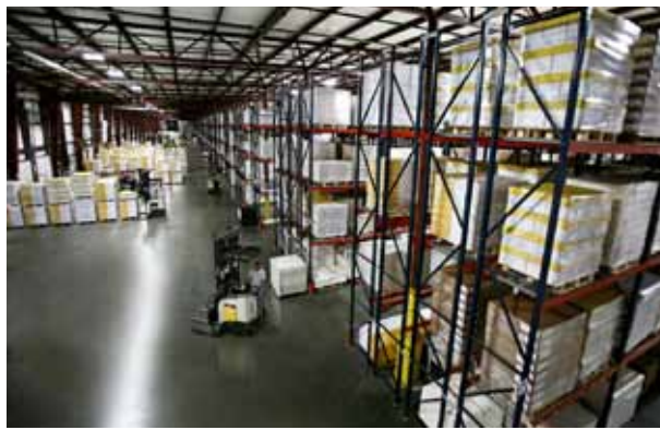
WOW's ever-changing warehouses with solid steel racks is filled with millions of pounds of cheese and paper created untenable RF issues.

WOW material handlers, forklift drivers, and truck loaders depend on Wi-Fi to make their warehouse processes more efficient by gaining universal access to real-time inventory information and eliminating counting and picking errors. The devices are used for a variety of purposes such as scanning palette and product locations, clocking hours, tracking product movements, tow motor inspection, trailer inspections, driver signatures, calendar entries, and MSDS tracking.